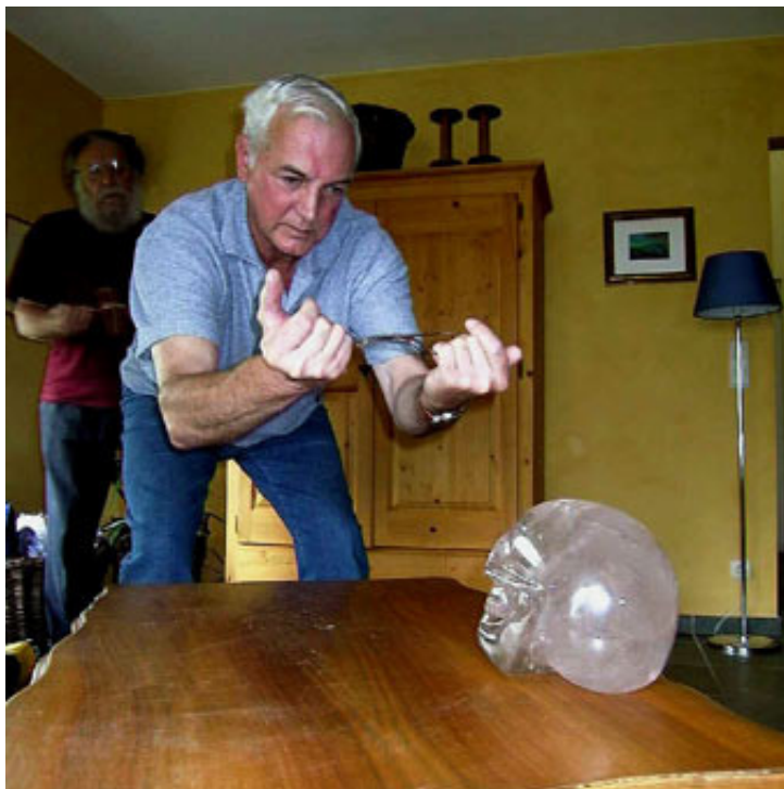
Here we see one of the Belgium practitioners using the Lechner Antenna to measure what energies was “Portal de Luz” emanating – three times they found he was emitting the - human senses – what can this mean?

Well, I don't want to leave you in suspense – so let me just tell you exactly what frequencies they uncovered that “Portal” was emitting. Are you ready – “He” was sending out the frequencies of the five human senses! Let me say that again, “he” was acting as if he was a living human being, sending out the frequencies of the five human senses. The group’s teacher was astounded and he didn’t believe it was possible, so he told his students to check again – they re-did the energy readings two more times and again the Lecher Antenna would flip down when the frequencies of the five human senses were measured. Now what does this say about our crystal skull? I think it is supporting the idea that “He” is alive with a living consciousness that is somehow linked with our own human consciousness – go figure this one out.