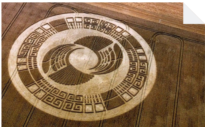
This is a photo of an example of a Crop Circle that appeared in England in 2016 (taken from image shared via the internet)

The best way I know how to illustrate what this spiritual plane of existence might be like is to think about our radio or TV channels. The radio/TV channels or stations are each separated by a different frequency being broadcast. If you don't have a radio or television set, then you can't tune in to these channels but still these frequencies or energy waves are being broadcasted and are constantly all around us – it is the same for our mobile phones and the Wifi signals for the internet, to pick it up you need the right device. I was even told by a good friend, whose father worked for a big American broadcast company many years ago, that there were some radio channels they were hearing people speaking on but there were no radio stations broadcasting on those frequencies (where these souls talking who had passed on – on the 'Other-side' as it is called?). Enough, said, let me move on then.