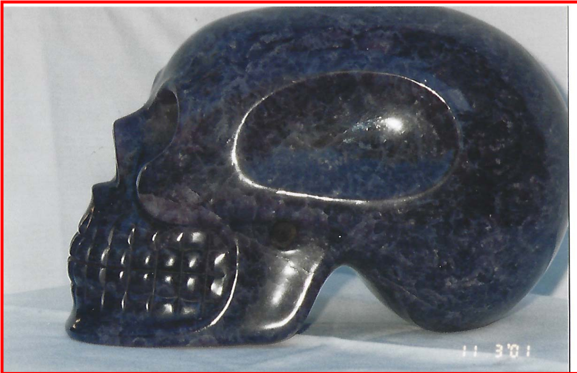
The Ancient Amethyst Skull, "Ami"